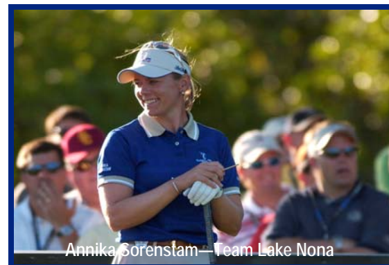
Annika Sorenstam—Team Lake Nona